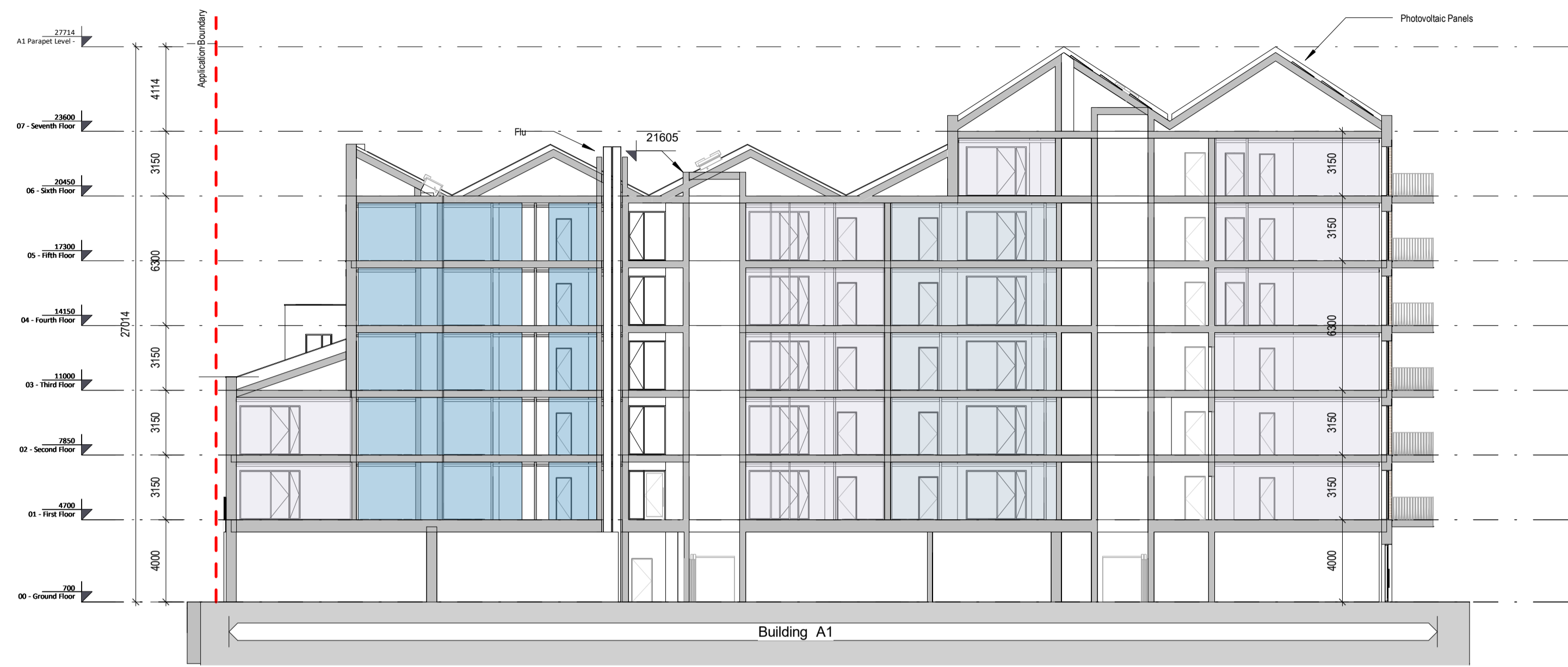
1 A1 Section A-A 1:200