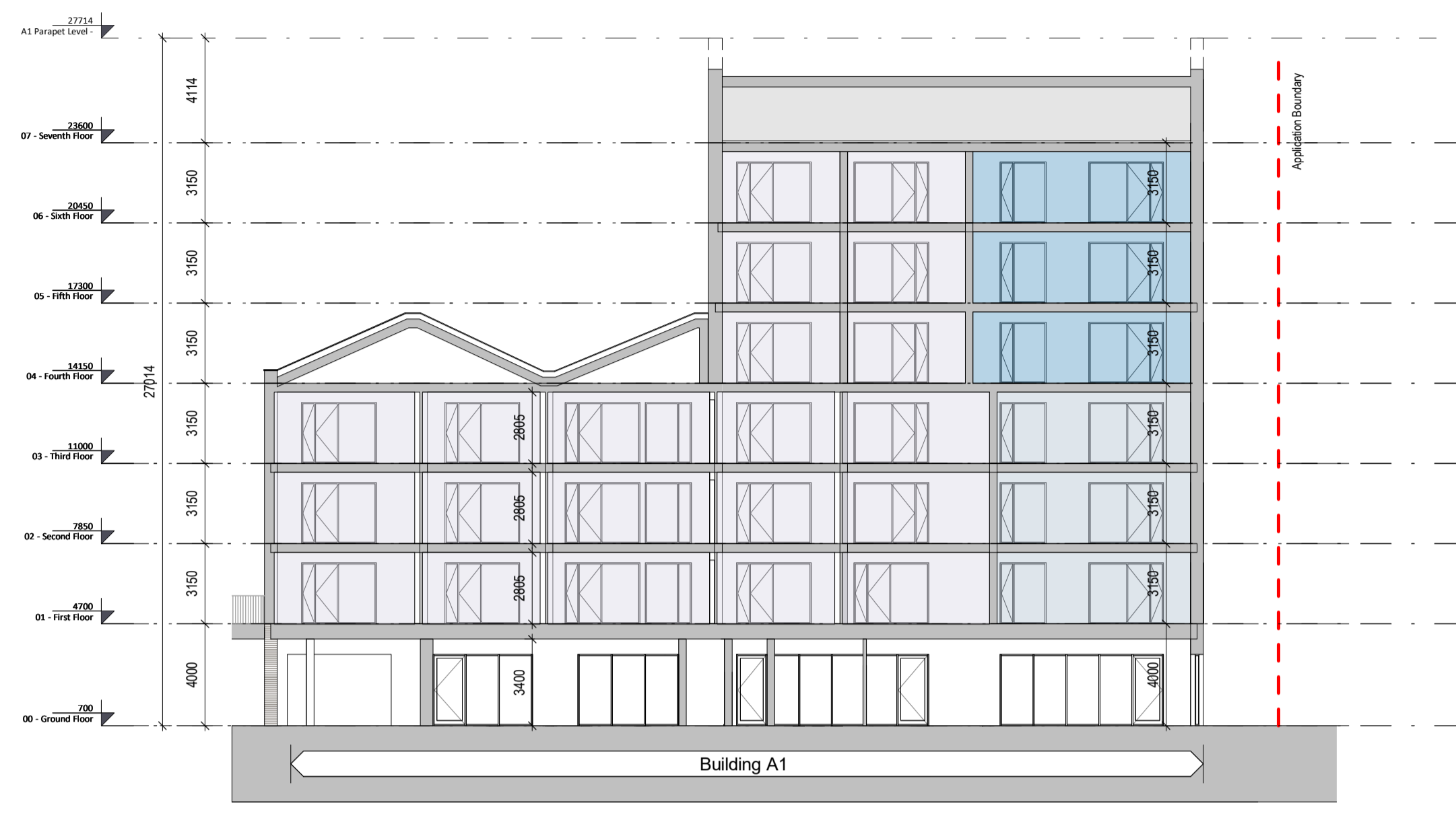
2 A1 Section B-B 1:200